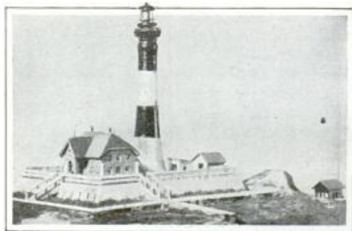
Fashioned from Plastic Wood, This Model Resembles in Every Detail the Fire Island Lighthouse

Fashioned of plastic wood, the famous Fire Island lighthouse has been reproduced in model form. Millions of passengers on ocean liners have been protected by this lighthouse as their ships entered or left New York harbor, and it has become a landmark for thousands of regular travelers. The model is carved entirely from plastic wood. Four pounds of material were used in producing the model, which is nine by ten inches by six high.