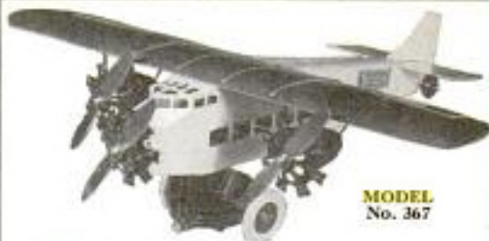
MODEL No. 367