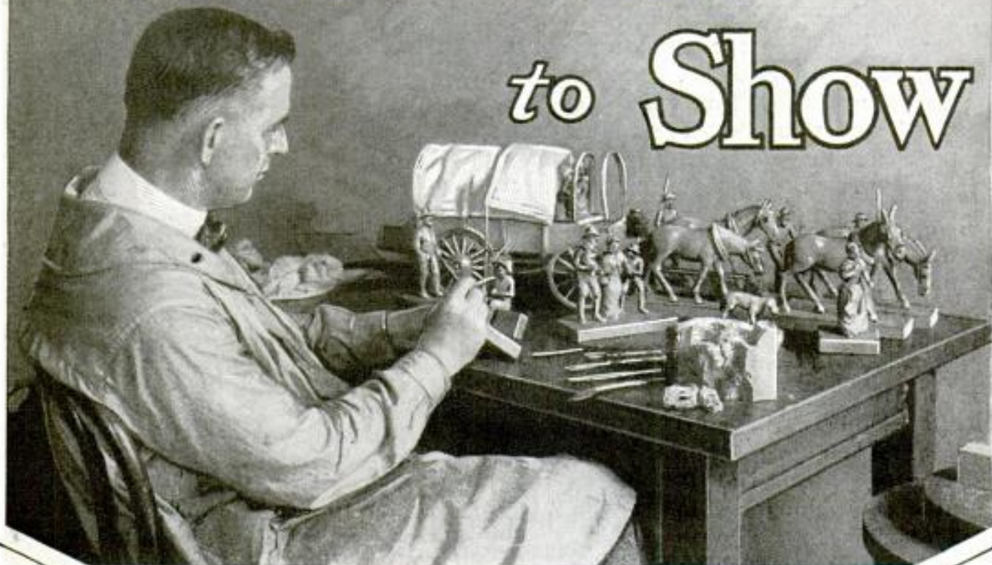
Government Sculptor at Work on Plastic-Wood Model of Prairie Schooner, Our First Transcontinental Vehicle, for Exhibition in the Transportation Exhibit at Seville, Spain