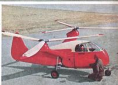
Has retractable landing gear

DOES POLAR ICE THREATEN TO UNBALANCE THE WORLD?