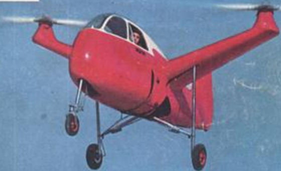
Sport Plane Helicopter Built of Plywood—Page 78